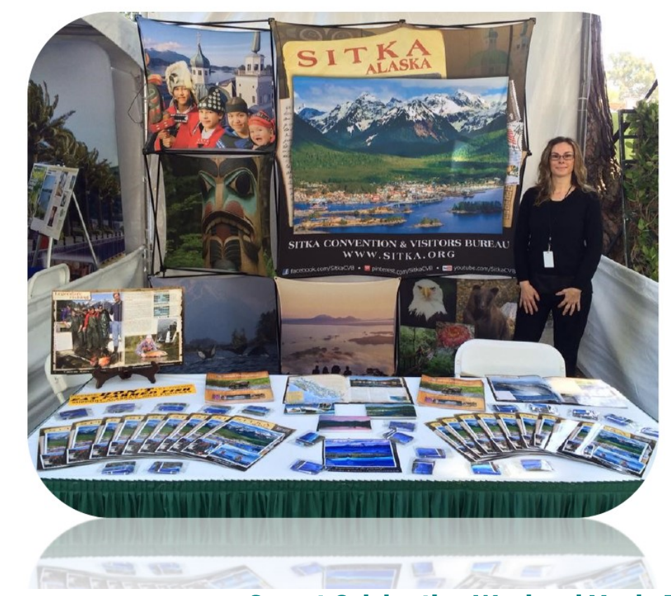
Sunset Celebration Weekend Menlo Park, CA

The three-year marketing plan serves as an overarching path for Visit Sitka's purpose in the coming years. As annual work plans develop within budget and metric parameters, this roadmap will guide staff and inform marketing programs and target market efforts. As a flexible document, revisions will be made as necessary to accommodate new business realities or changes in priorities.