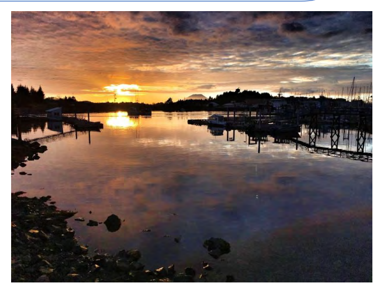
Sitka 2030 Comprehensive Plan | December 2016 Draft