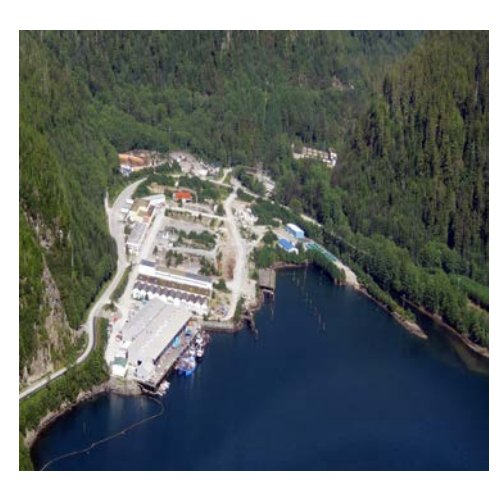
GPIP site of future deep water dock in Sitka

This Spring, the construction of the new Multi-Purpose Dock will begin at the Gary Paxton Industrial Park (GPIP). The refurbished barge will allow drive down access to the dock and plenty of space for boat maintenance. Sitka Economic Development Association is very excited about the economic benefits the dock will provide for the marine service sector in Sitka.