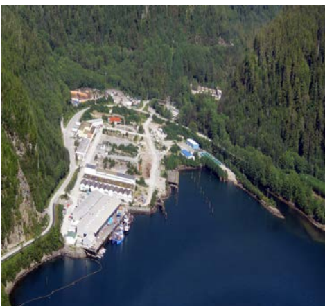
GPIP site of future deep water dock in Sitka

This Spring, the construction of the new Multi-Purpose Dock will begin at the Gary Paxton Industrial Park (GPIP). The refurbished barge will allow drive down access to the dock and plenty of space for boat maintenance. Sitka Economic Development Association is very excited about the economic benefits the dock will provide for the marine service sector in Sitka.