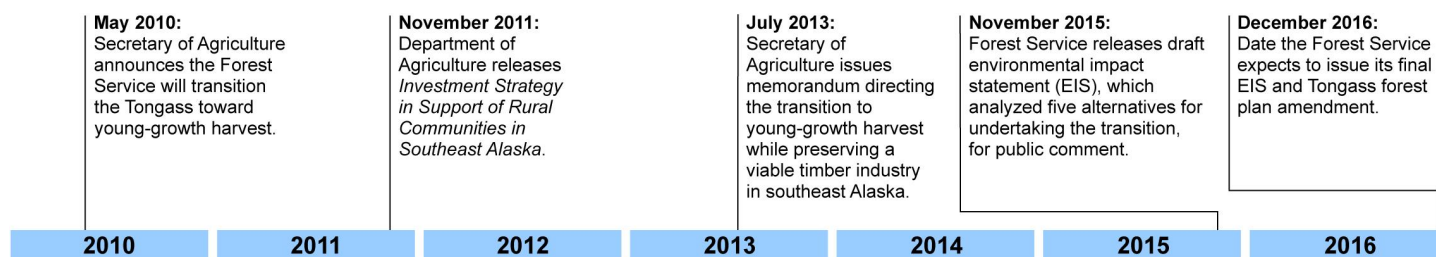
Figure 3: Timeline of Events Associated with the Forest Service’s Transition to Young-Growth Timber Harvest in the Tongass National Forest

Source: GAO analysis of Forest Service information. | GAO-16-456