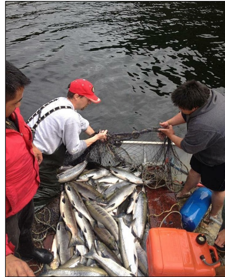
Subsistence sockeye salmon harvesting near Unuk River, Southeast Alaska.

117. Canadian authorities have not required proponents of the six B.C. Mines to assess impacts from the mine projects on downstream water quality in areas populated by the salmon and eulachon upon which Petitioners' subsistence way of life and culture depends, despite having knowledge of the threats from these mines to Petitioners' rights. For five of the six mines, the proponents have not assessed potential changes to water quality in these downstream watersheds. Moreover, none of the proponents has assessed worst-case scenarios for downstream waters should their tailings-dams fail.