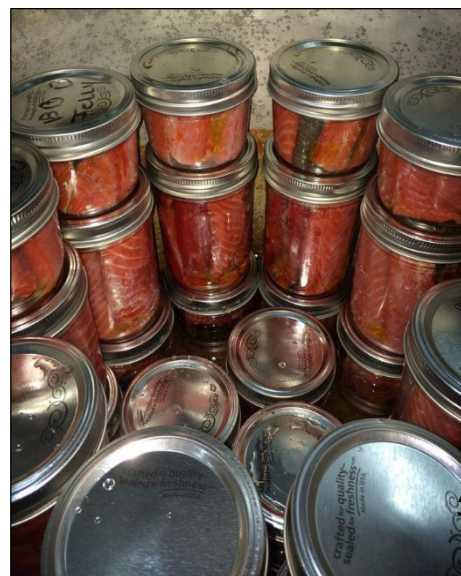
Canned smoked salmon.