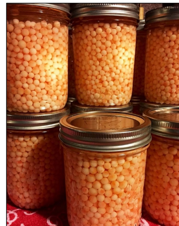
Jarred Unuk River salmon eggs.