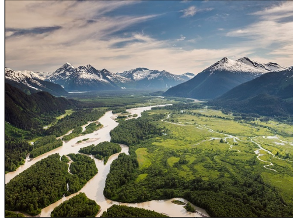
View of the Tulsequah River, looking east towards the confluence with Taku River.