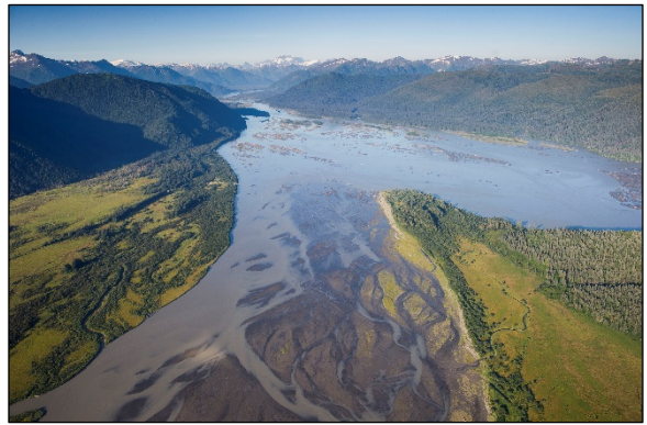
Stikine River near Wrangell, Southeast Alaska. Photo used with permission.