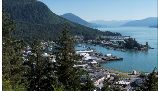
Wrangell, home of Wrangell Cooperative Association, sits near the mouth of Stikine River in Southeast Alaska.

Our traditional harvesting practices are important to our livelihood, and to safeguarding our family's welfare, especially given Wrangell's location off of the continental road system. For example, I remember on September 11, 2001, when traffic was halted by plane and boat, no supplies could come into Wrangell through normal commercial networks. The grocery shelves emptied in hours, and our community was reminded of the importance of our relationship with the land. 39