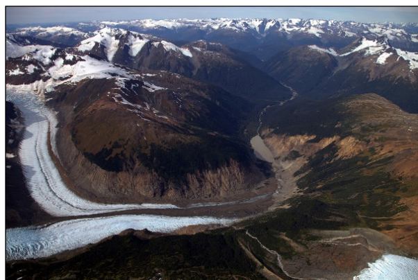
The proposed KSM Mine is located in the upper Unuk River watershed. Photo used with permission