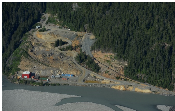
The proposed Tulsequah Chief Mine sits along the Tulsequah River, a tributary to the Taku River, 10 miles upstream from the Canada-US border.