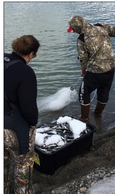
Hooligan from Stikine River are harvested with weighted nets. 11

Subsistence harvests on the Stikine River, including salmon fishing, are not only about economics. It is a traditional way of living that has been passed down to my children through several generations. My 92-year-old grandmother for example, told me stories about hanging salmon upon wood stakes. Fishing provides a center for social life in our community as well. I can remember many times when, after a productive day on the river, we would invite families together to process our catch together. When I was young, I did not speak much during these meetings, but rather sat and listened to the elders. I heard so many stories during these get-togethers, so important to my knowledge and identification with my community and culture. ... I have taught both