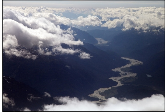
Upper Unuk River, British Columbia, Canada. Photo used with permission