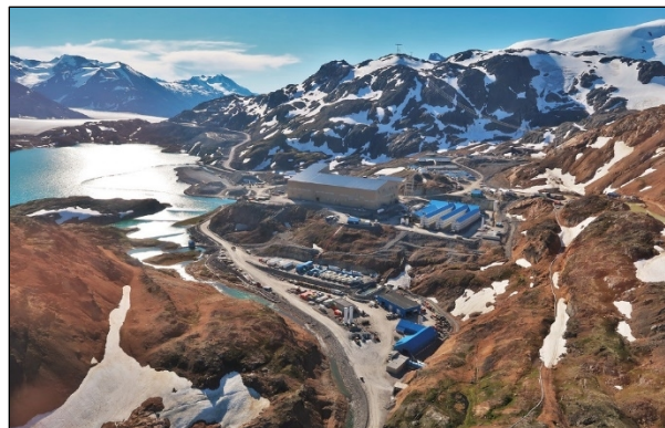
Brucejack Mine.