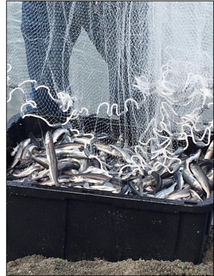
Hooligan from Stikine River are harvested with weighted nets.

29. Salmon and eulachon fishing are essential subsistence practices among Southeast Alaska Native communities in the Taku, Stikine, and Unuk watersheds. These communities typically harvest salmon using gillnets, set nets, or trolling lines from boats. 27 Salmon are then processed and preserved in many ways, including by smoking, canning, or freezing. 28 Eulachon are known colloquially as “hooligan” or “ooligan.” 29 They are harvested using float or seine nets, and are processed by smoking, frying, or baking. 30 The oil is rendered to produce eulachon grease. 31