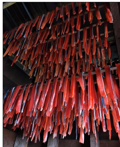
Salmon harvested from the Taku River.

Traditional subsistence harvest on the Taku is a way of life. It is central to our culture. ... I was taught to respect the river because it provided so much for us. We were taught never to mistreat the river and its watershed, always to leave it the way we found it. We never took anything more than we could use – fish, game, berries – and never wasted anything. Once I was on the river with a member of the US Forest Service. He