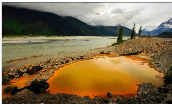
Acid Mine Drainage from the old Tulsequah Mine collects in a retaining pond adjacent to the Tulsequah River.

54. The difficulty of containing acid mine drainage over decades is evident in the case of the old Tulsequah Chief Mine in British Columbia. Although the mine, located at the same site as one of the proposed B.C. Mines, ceased operations in 1957, toxic acid mine drainage from the mine has polluted the watershed since its closure. 80 A 2016 study commissioned by the government of British Columbia found that “multiple undiluted and untreated sources of historic mine waste are discharging into the Tulsequah mainstem and side channels from surface water and groundwater inputs,” posing “unacceptable risks to fish, fish eggs, and pelagic invertebrates.” 81 It is estimated that 12.8 litres of acidic, metals-laced water escape the mine site every second – over 400 million litres per year – into the Tulsequah River, the largest tributary of the Taku. 82