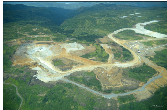
Red Chris Mine.