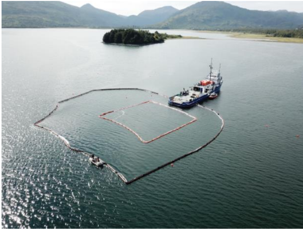
(boom in Womens Bay over the F/V St. Patrick on August 21)