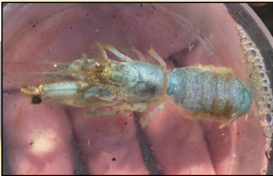
Healthy Blue Mud Shrimp.

The above Blue Mud Shrimp from Ketchikan is infected with the invasive isopod Orthione griffenis . Notice the shell is bulged out and deformed on one side of the body due to the isopod growing underneath. Left inset image shows parasite removed from host.