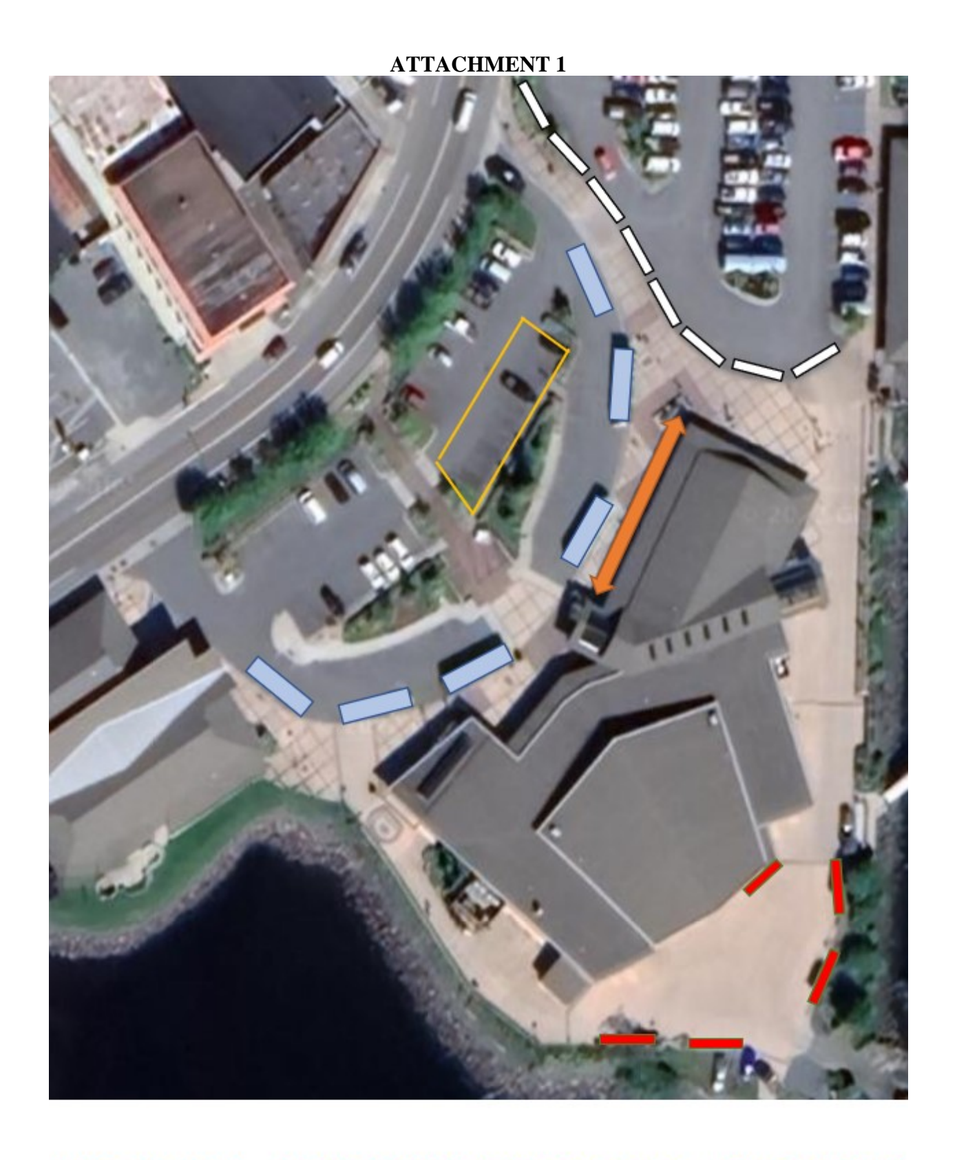
ORANGE – Vendor Sales RED – Outfitter Parking YELLOW – Taxicab Staging LT BLUE – Dock Shuttle White – Independent Sales Pickup